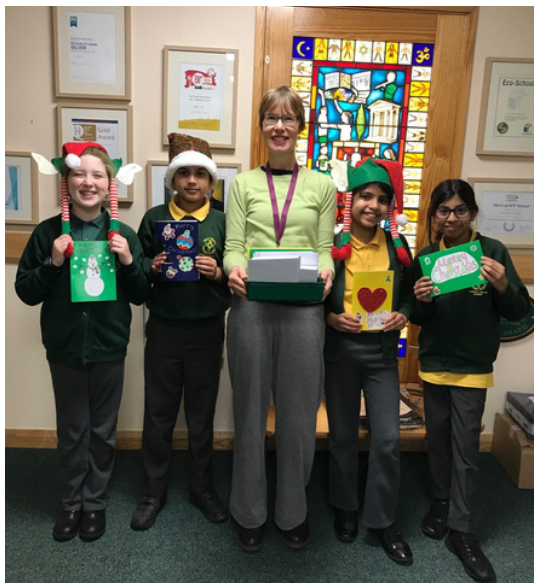
Holy Trinity Primary School with their Santa-grams