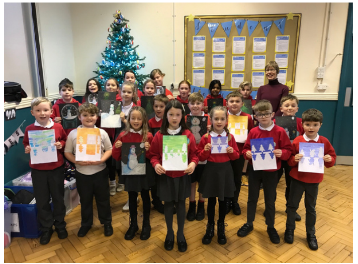
The children at Greetland Academy with their creations