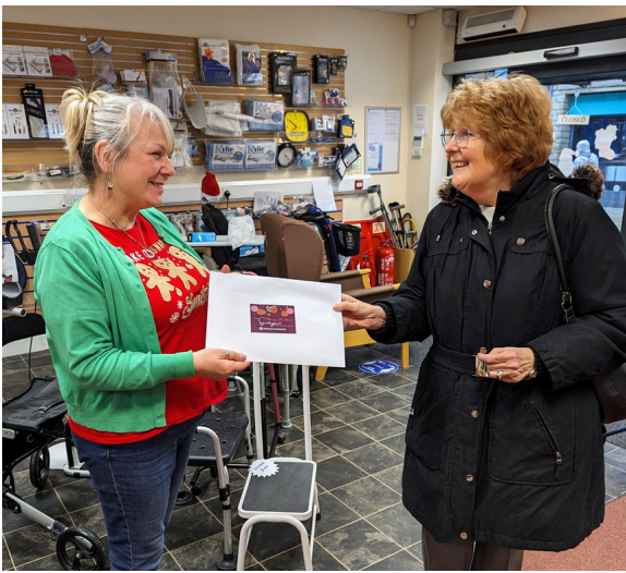
A visitor to Age UK receiving her Santa-gram