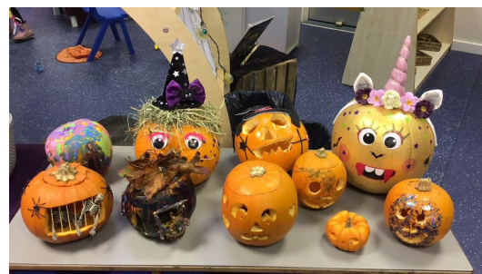
Pumpkin Decorating Competition