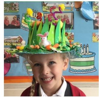
Easter Bonnet Parade

To become a member of FOGS or to find out more visit the website or contact FOGS@greetlandacademy.org.uk